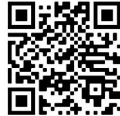
FFA Fundamentals Choice Board