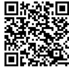
CDE, LDE and Agriscience Research Choice Board